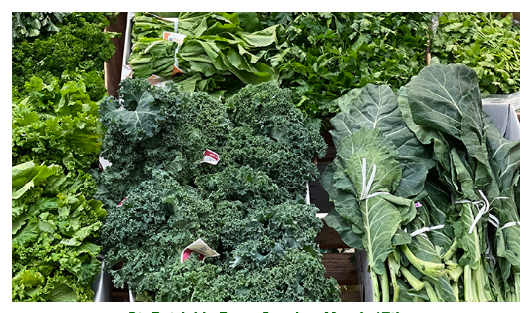
St. Patrick's Day - Sunday, March 17th

Food lovers and math lovers unite on this day that honors the beloved mathematical constant 3.14, the ratio of a circle's circumference in relation to its diameter. Is it any coincidence that it's also Albert Einstein's birthday?