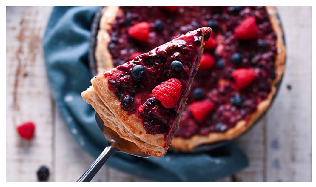
Pi Day - Thursday, March 14th

Food lovers and math lovers unite on this day that honors the beloved mathematical constant 3.14, the ratio of a circle's circumference in relation to its diameter. Is it any coincidence that it's also Albert Einstein's birthday?