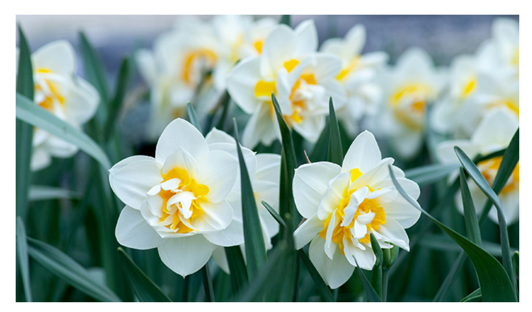
First Day of Spring - Tuesday, March 19th

For those of us in the Northern Hemisphere, we welcome the March Vernal Equinox, which marks the beginning of Spring. Vernal means 'relating to the spring' and Equinox means 'equality of night and day.' Finally, longer, sunnier days!