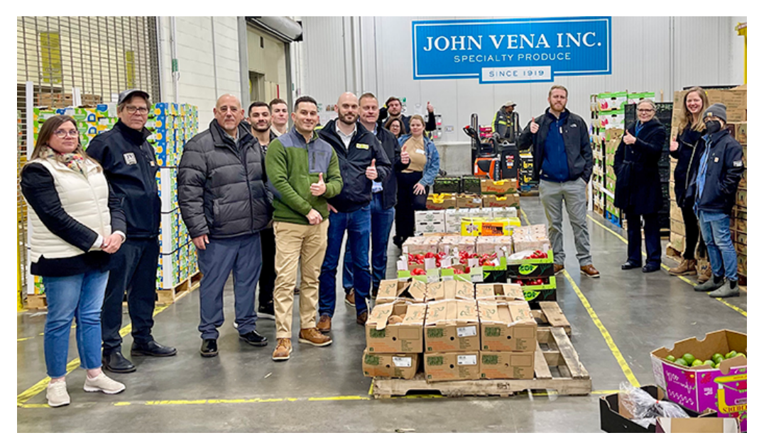
The Eastern Produce Council

On March 19, the 2024 EPC Leadership Class made us their first visit before heading to Holt Logistics at the Port of Gloucester, NJ. This professional development program provides an opportunity for its participants to grow and gain valuable insight from experiences both in the field and in the classroom.