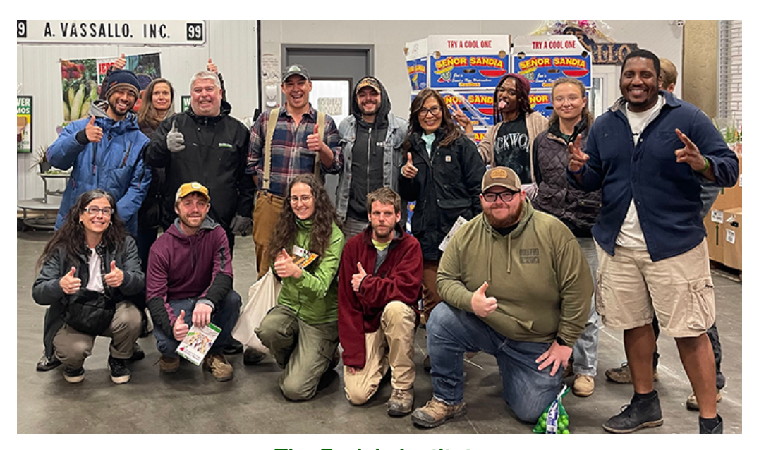
The Rodale Institute

We're always happy to welcome these wonderful groups as they explore the Market: