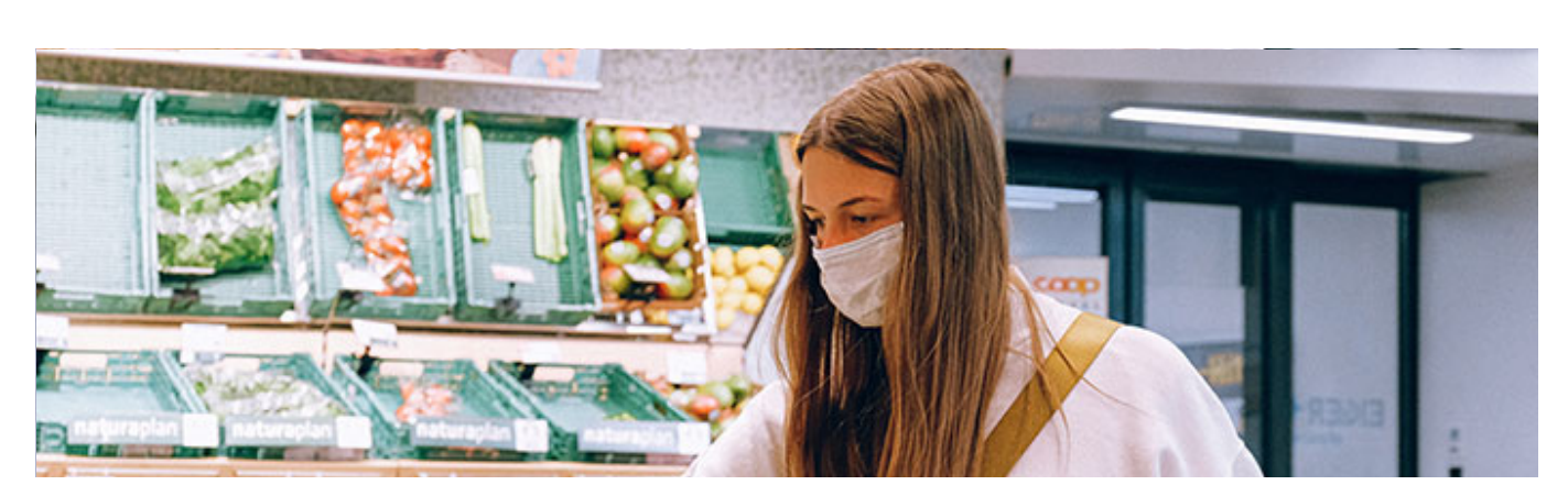
Just a Reminder - Wearing is Caring. As of August 12, 2021, masks or face coverings are required at Philadelphia indoor businesses and institutions.

October 1st (Friday) – World Vegetarian Day October 7<sup>th</sup> (Thursday) – National Kale Day October 12th (Tuesday) – National Farmers' Day October 15<sup>th</sup> (Friday) – National Mushroom Day October 21<sup>st</sup> (Thursday) – National Apple Day October 26<sup>th</sup> (Tuesday) – National Pumpkin Day October 31st (Sunday) – Halloween