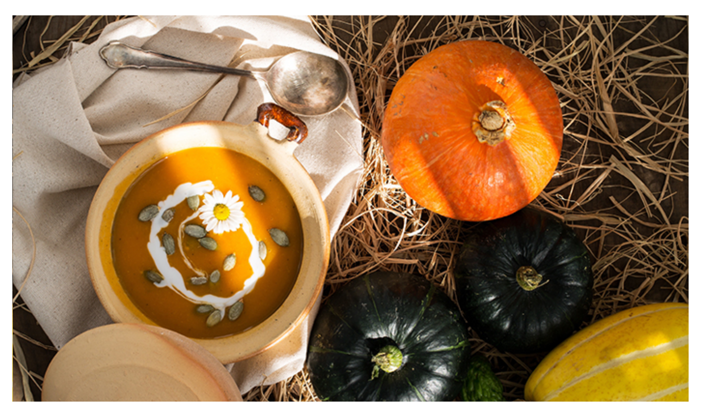
Are you ready to trade in your sandals for boots?

"And all at once, summer collapsed into fall." ~ Oscar Wilde