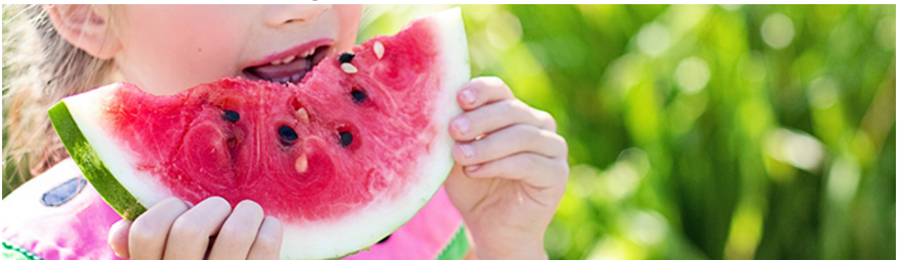
August 3 – National Watermelon Day August 8 – National Zucchini Day August 19 – National Potato Day August 22 – Eat a Peach Day