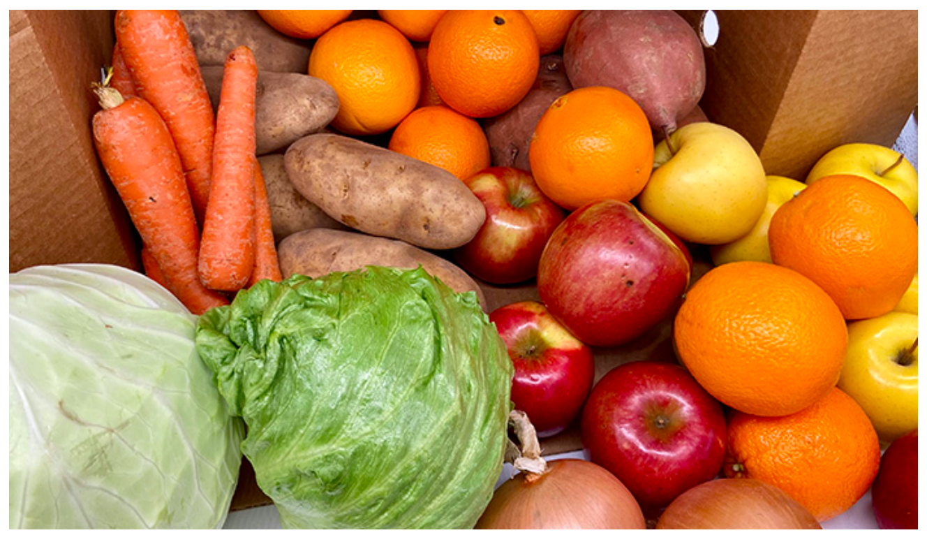
They say good things come in small packages. Well, a 20 lb. box full of fresh produce may not be so small, but it's full of good things.

In response to the coronavirus crisis, the <u>United States Department of Agriculture (USDA)</u> established an innovative way to help people on two fronts – American families in need as well as the food industry that suffered staggering losses. The USDA's Agricultural Marketing Service (AMS) developed the Coronavirus Food Assistance Program (CFAP) <u>Farmers to Families Food Box Program</u>. In a nutshell, the program seeks to provide critical support to American farmers, distributors, and processers, while ensuring that all Americans have access to fresh and wholesome food during this national emergency.